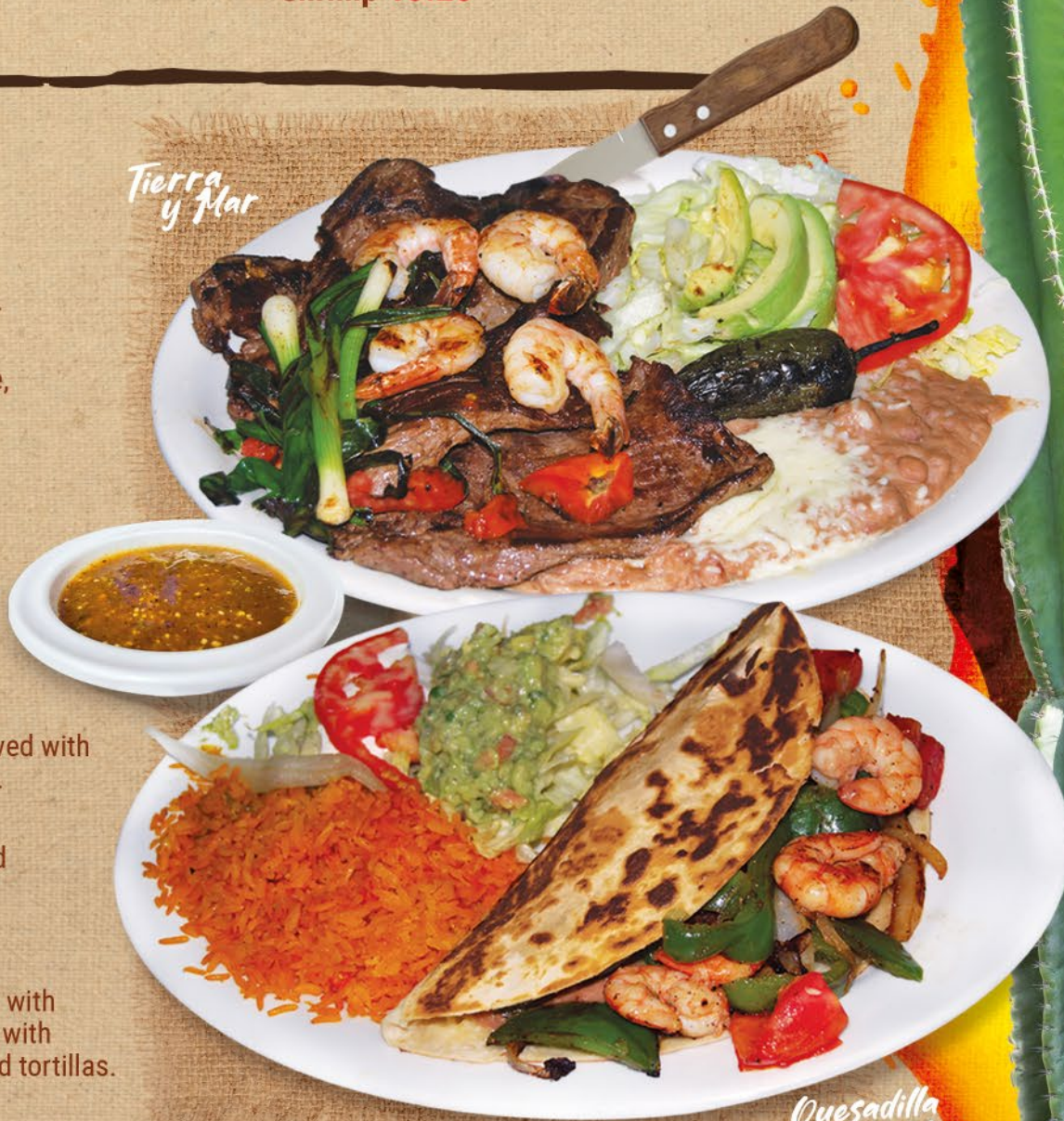
Quesadilla Del Mar