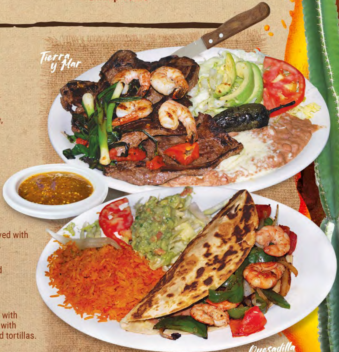
Quesadilla Del Mar